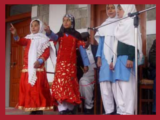
Students presented several colorful programs including poem readings, national songs, tableaux and speeches.