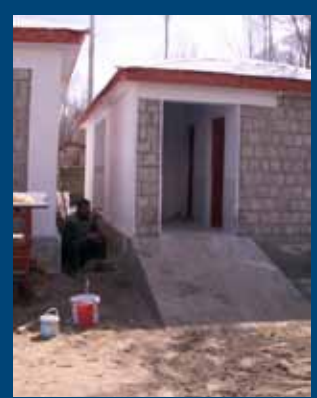
Construction stages: multi-purpose hall, classroom, standard and barriers-free washrooms, veranda, winter view of the construction in progress